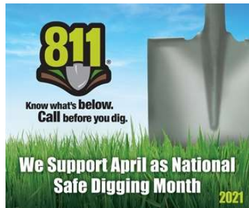
2021 Safe Digging Month

The logo and artwork are available by contacting one of our Damage Prevention Liaisons at www.pa1call.org/liaisons .