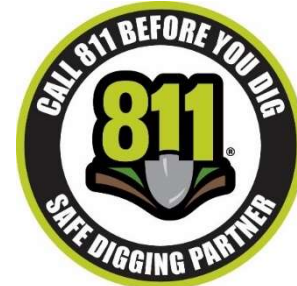
Safe Digging Partner Logo